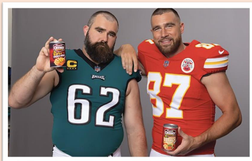
Actual soup -- and servers -- may vary.

code for more information, call (609) 259-9177 or visit www.firstbaptistallentownnj.org .